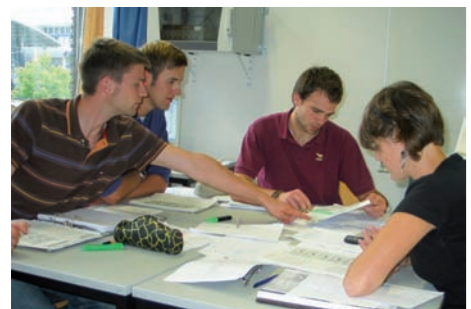
Working in teams with students

Students enrolled at the university pay a semester contribution. This fee is required for expenditures, such as public transport. This amount can vary each semester. For detailed information about current fees see the website of the Registrar' s Office: www.h-brs.de/en/contact_students_office.html .